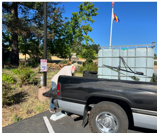
Gary Bunt watering our trees with reclaimed water