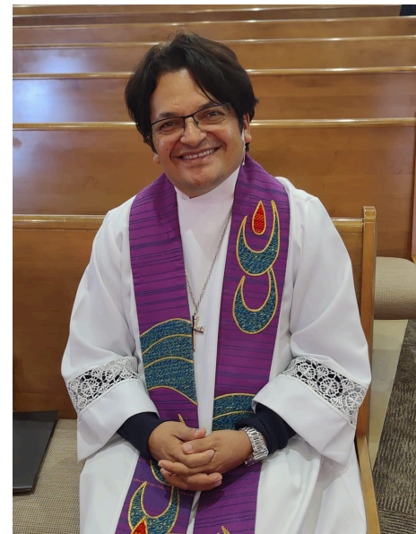
December 10th - Joint worship with St. Matthew's