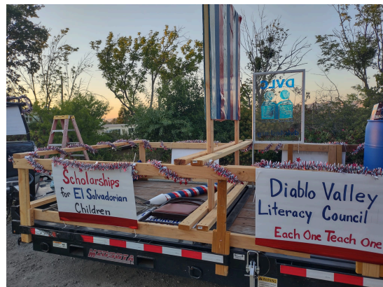
July 4th - Concord Parade