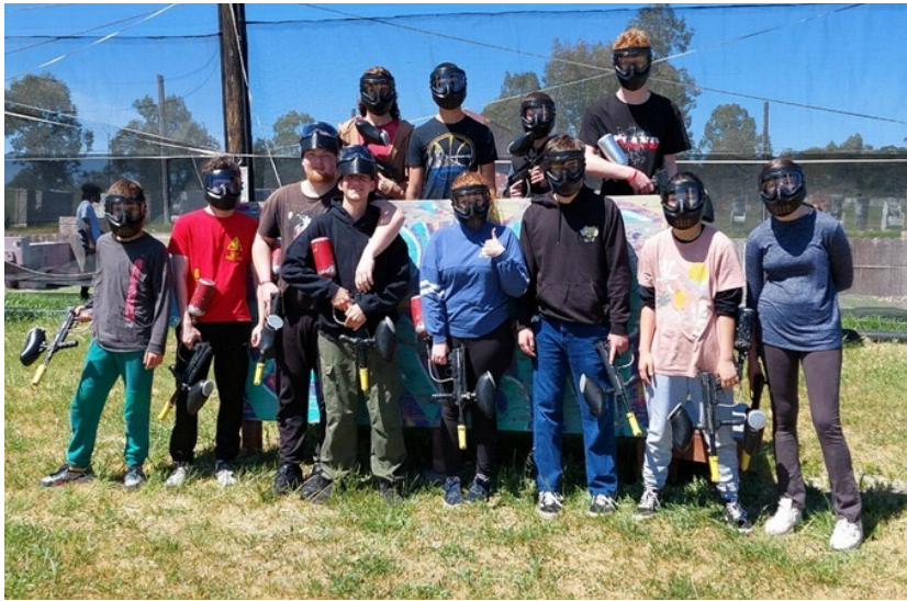
April 30th - Youth Group outing - Paintball!