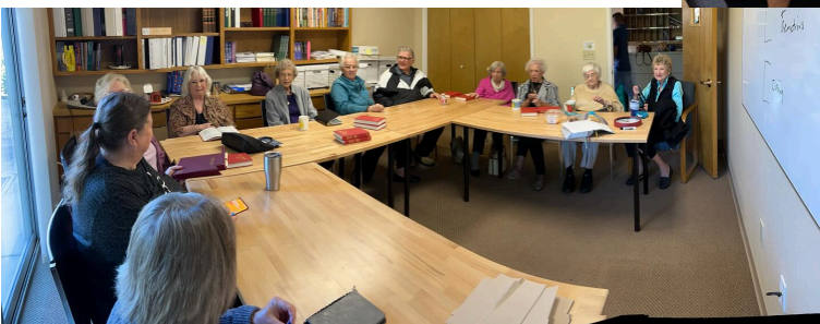
October 1st - Sunday School begins!