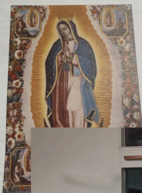
December 12th - The Feast of Our Lady of Guadalupe