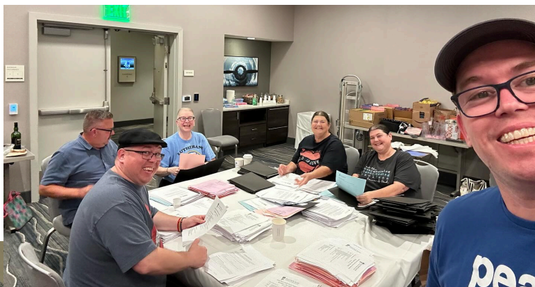
September 17th - Synod Assembly