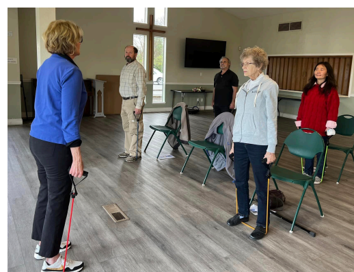
December 21st - Young at Heart Strength Training Class