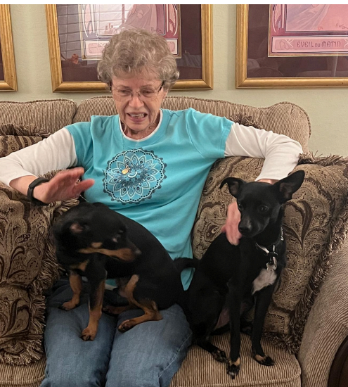
February 15th - Home Groups!