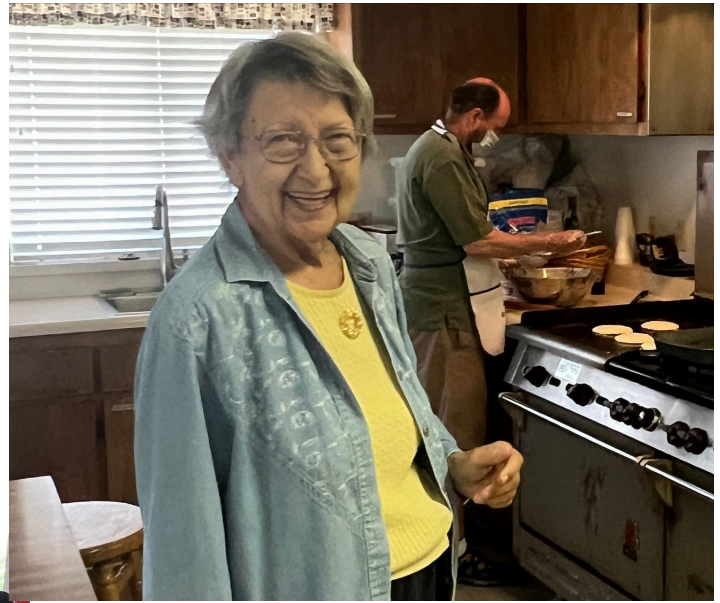
May 24th - Pancake Fellowship