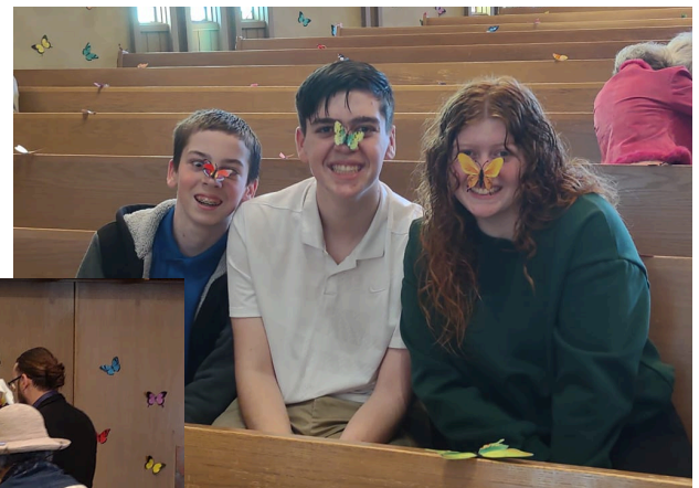
April 9th - Easter Sunday