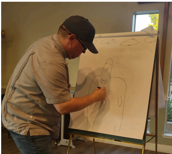
August 4th - Game Night