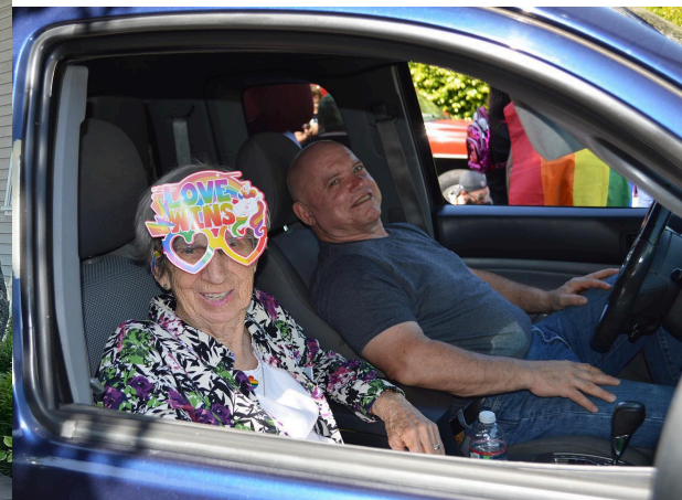
July 5th - Pride Parade