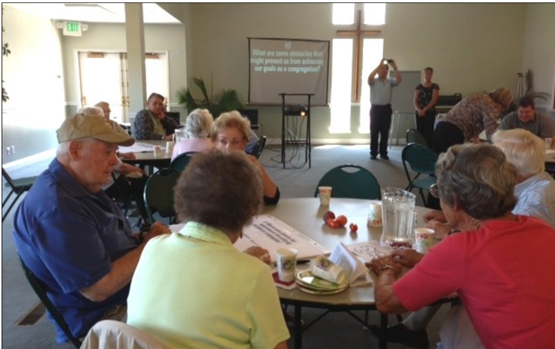
Visioning Event, Sunday Morning, July 21 in Fellowship Hall