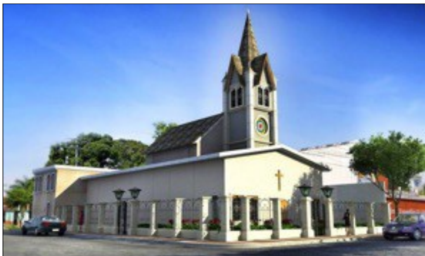
Resurrection Lutheran Church's future completed vision.